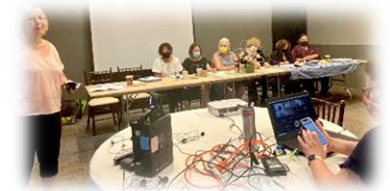
Hybrid meeting with a video presentation

We held NGC Environmental School, Course 1 this fall, virtually but with a twist. The course was held on Zoom over four evenings (5:30 – 8:30) so it could be attended by those who may be working during the day.