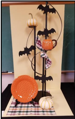
A design and hort at Flower Show School held in Cincinnati, Ohio in early October

National Garden Clubs (NGC) has started a series of NGC Virtual Resources Experiences that is open to all NGC members. The first experience offered to us was a virtual tour of Aero Farms which is the World's largest vertical farm. Watch your emails for announcements and links to these Virtual Experiences programs via Zoom.