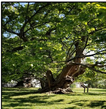
Catalpa Tree

Our Councils continue to be very active. In October, Landscape Design School Course 3 was held in Columbia, Maryland. The Council also took a trip to the historic Hampton Mansion. On the grounds they saw the magnificent Catalpa trees. Most of the trees are over 200 years of age.