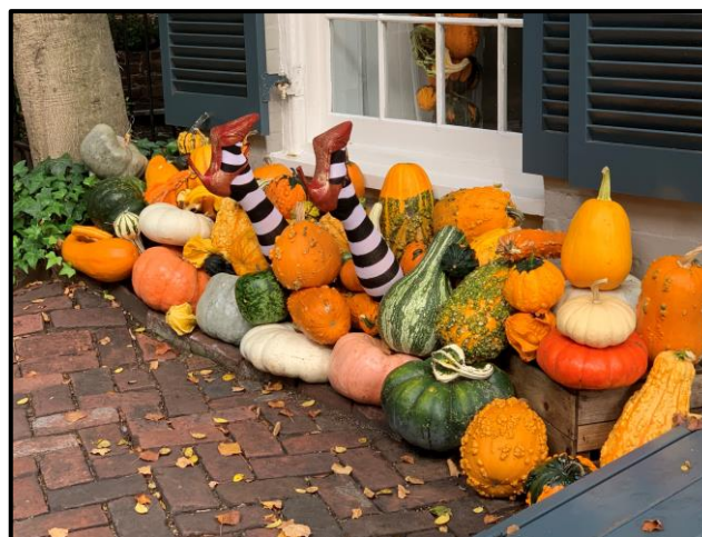
Pumpkins in Alexandria, VA