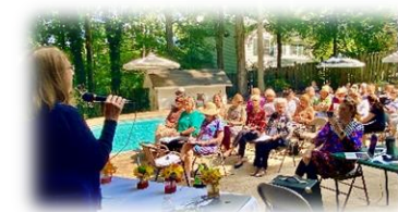
Meeting in person and on Zoom