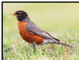
Iris Cisarik, Birds, Bugs, Butterflies and Endangered Species