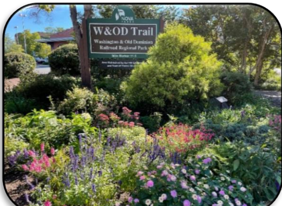
Ary Hill Garden Club – celebrating 40 years of the W&OD Trail Garden