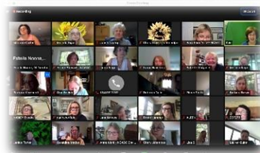
Zoom meeting with breakout rooms

in-person. We’ve shown creativity as we hold flower shows, meetings, anniversaries, and dedications. We have four districts within NCAGC and each district did something different for their Fall Meeting.