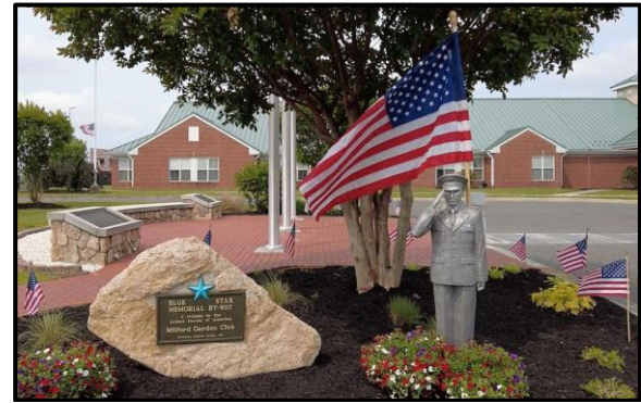
Milford Garden Club's Blue Star Memorial dedicated in May 2023

recognizable in their communities. Many clubs meet throughout the summer months maintaining community gardens and historic sites. Their visibility generates interest in becoming a garden club member.